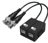
PFM800-E Passive HDCVI Balun