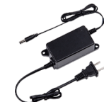
PFM320 12V 2A Power Adapter