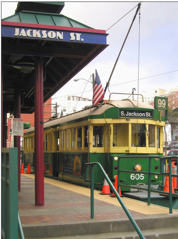
Jackson Street Trolley

The existing wireless mesh surveillance system connected ten cameras over a six square block area to maintain safety. This system was inefficient and unreliable causing information loss, and was difficult to support. Cascade Networks decided to find a better solution that would be easier to maintain and expand going forward, serving this booming multicultural community.